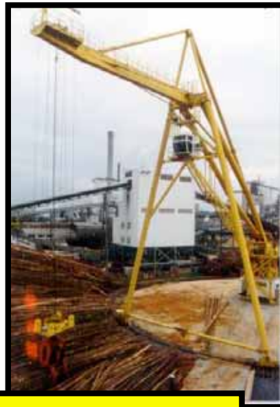
LOG BOOM CRANES

TECHNICAL DATA SHEET P&H LOGBOOM CRANES LOG HANDLING CRANE