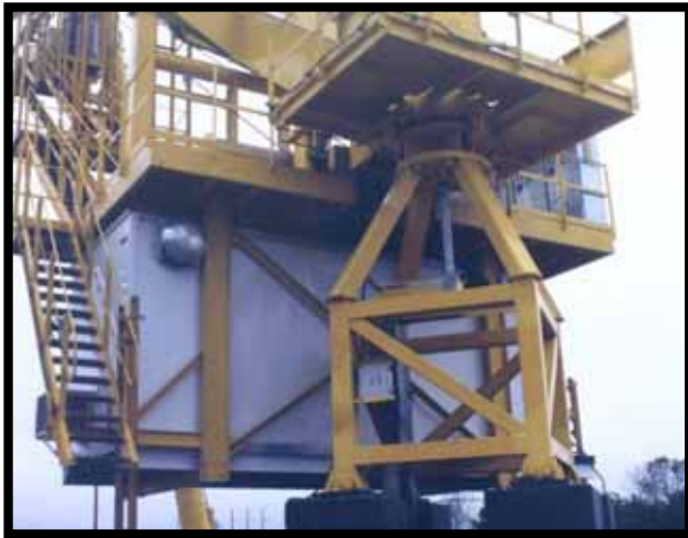
P&H Exclusive Tower Design